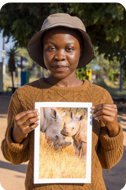
“Will my children see wild rhino?” – Celebrate (now a lodge chef)

Wild Shots Outreach uses photography to support young Africans from disadvantaged communities in accessing their wildlife heritage and in developing employment skills in conservation & tourism. Founded in 2015, this award-winning South African NGO has taken more than 1400 young people living adjacent to Africa’s Protected Areas on their first ever game drive. The WSO Bursary Fund provides access to further studies, training and employment.